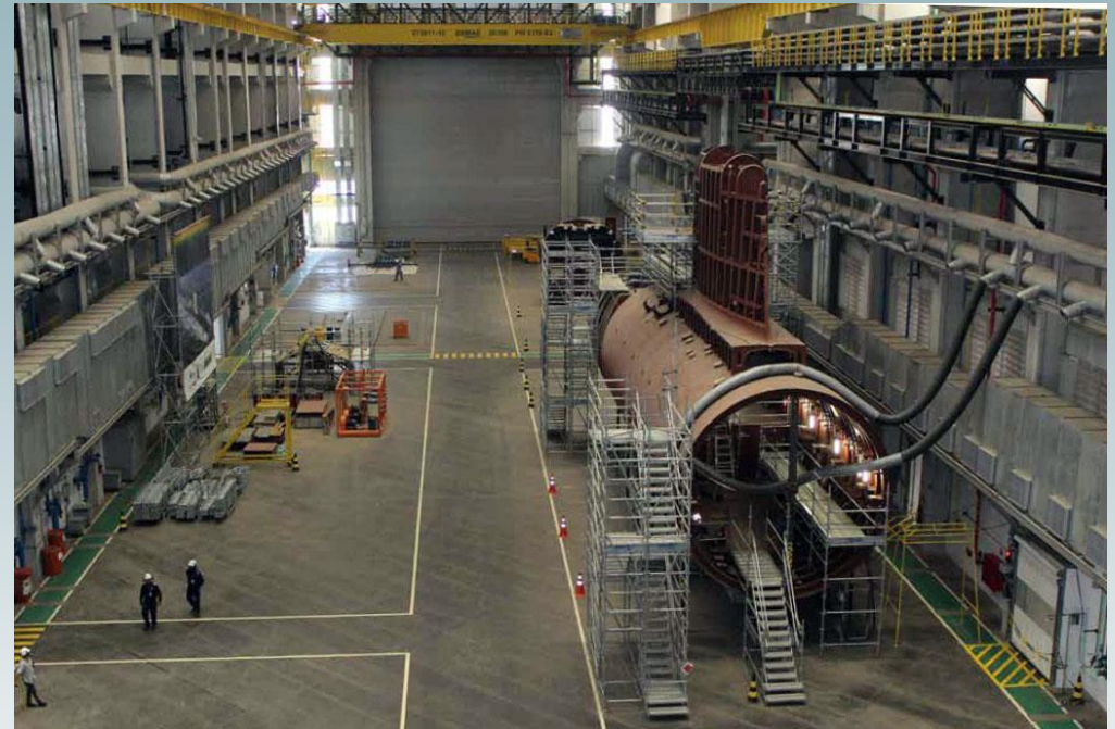
Submarines under construction at Brazils' ICN yard (Itaguaí Construções Navais – RJ).

Brazil at 22 nd position, sums 113 defense vessels.