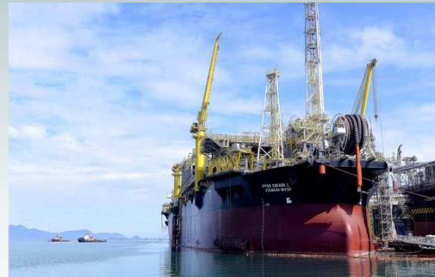
FPSO Cidade de Itaguaí currently in offshore operations at Santos pre-salt ultra-deep water field (SP-Brazil)